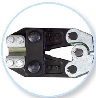
Screwing system that makes easier the changing of the cutting edge.

Very resistant scissors with interchangeable 3 edge blades. They are made of forged steel and are suitable for cutting steel rods up to 16mm in diameter.